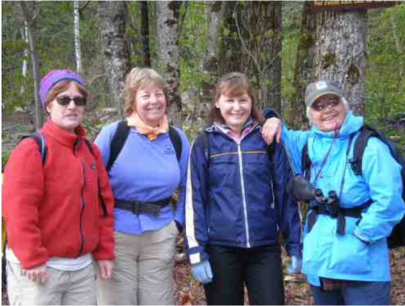
More pictures from the Adirondacks.

As some of us move into retirement, we have more time available during the daytime hours for doing some trail work. At our last meeting we discussed the possibility of scheduling a trail maintenance session during the week, perhaps for an hour or two anytime between 8:00 AM to 3:00 PM. Another possibility is a list of volunteers willing to be called when the need arises, for example, when a scheduled session gets rained out. If you are interested in a scheduled daytime trail maintenance session or would be willing to help out occasionally, please give Larry Fisher a call at 924-5803 or email him at lfisher1@rochester.rr.com to discuss the possibilities.